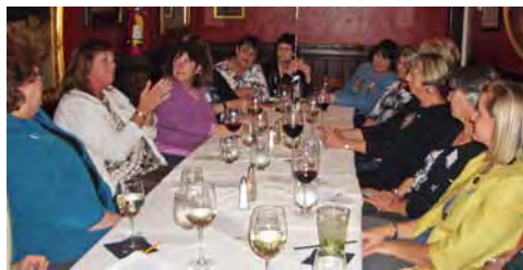
Seventeen women gathered for L&C on November 5 th in Stan’s Room at the National Hotel in Jackson. The topic “You can’t be what you can’t see” (the importance of role models) resonated with the group.

The format is simple. The group meets monthly from 5:30 to 6:30 p.m. on various week nights at rotating venues. There is no RSVP required. We gather for no-host drinks and to discuss different topics led by one of the committee members. Everyone is asked to fill out a card with their email address and ideas for future topics of conversation. At the end of the meeting, one of