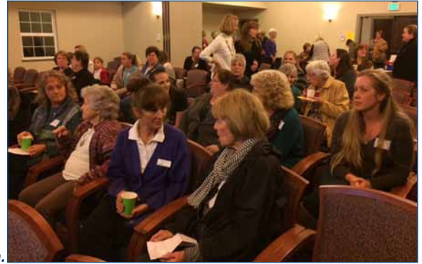
Fifty-five people attended the November STEM Program.