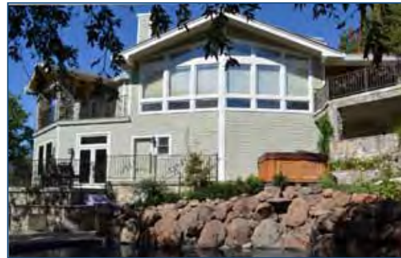
Canyon Oak Cottage