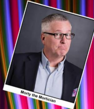
Mory the Mortician