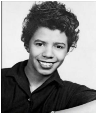
Lorraine Hansberry Playwright & Writer 1930 - 1965

Stormé DeLarverie was a trailblazing entertainer and civil rights icon whose resistance at the Stonewall uprising helped ignite the modern LGBTQ+ rights movement. She was a longtime community protector, and was known as “the Rosa Parks of the gay community” and spent decades performing, hosting, and safeguarding the LGBTQ+ community in New York’s Village.