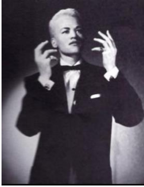
Stormé DeLarverie Activist 1920 - 2014

Stormé DeLarverie was a trailblazing entertainer and civil rights icon whose resistance at the Stonewall uprising helped ignite the modern LGBTQ+ rights movement. She was a longtime community protector, and was known as “the Rosa Parks of the gay community” and spent decades performing, hosting, and safeguarding the LGBTQ+ community in New York’s Village.